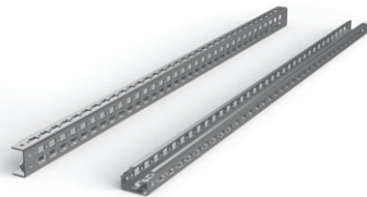
ID-F-NH (for mounting between the frame profiles)